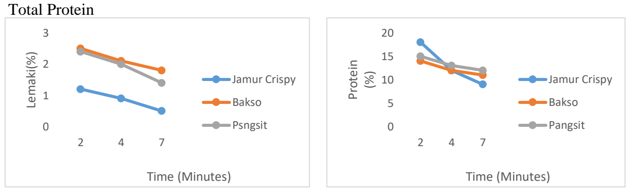
Figure 2. Effect of Frying Time on

From the picture above, it is proven that increasing the frying temperature can cause the content in the white oyster mushroom to die and damage its structure. Based on the test results, the conclusion is that the time for frying must be controlled. This is because it can increase the temperature to damage the structure of the content in the preparation (in this case, protein and fat). The optimal time for frying, so that fat and protein are not damaged is 10 minutes.